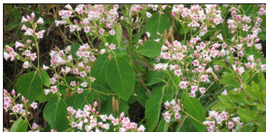
Spreading dogbane ( Apocynum androsaemifolium ), one of over 100 plant species native to the Palouse Prairie.