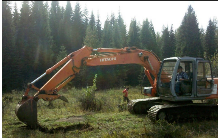
Site of road relocation project intended to reduce sediment inputs to stream. Sedge was harvested from the new road site and used to vegetate ditch plugs which were installed to divert water from degraded, straightened channel to historic channel.